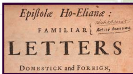
Title-page of James Howell's Epistole Ho-Eliaæ: Familiar Letters, Domestic and Foreign with signatures of Elizabeth and Robert.

The second notebook apparently was first used as EBB's Greek language