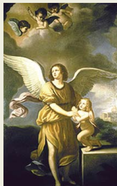
L'Angelo Custode by Guercino (Giovanni Francesco Barbieri), 1640 Civic Museum, Fano, Italy