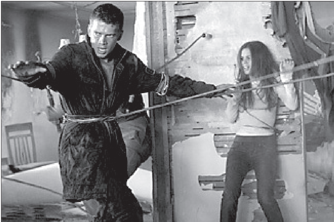
Hayden Christensen and Rachel Bilson struggle in a fight for their lives as David and Millie, in David Liman’s newest thriller, Jumper , which opened at the top of the box office this past weekend.

The concepts of teleporting and a war between underground societies have potential, but the plot is lacking and predictable. And there are so many ups and downs to Jumper that I got sick quickly. The movie builds up a war that has existed for centuries between the “Jumpers” and the Paladins (the Jumpers’ enemy) but leaves it as background and moves to the “save the girl” plot. It seems like the writers started different plot lines with good potential but only had enough time to pursue one. Not only do they execute one plot line, they choose one that has been done in almost every action movie, and usually not the memorable ones. By starting different plot lines and never bringing them