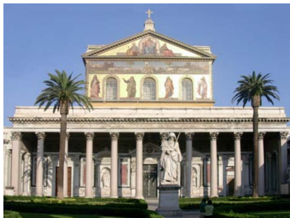
St. Paul’s Cathedral, Rome