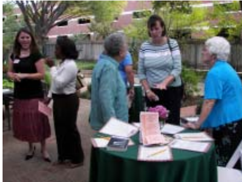
Interest Group sign-ups