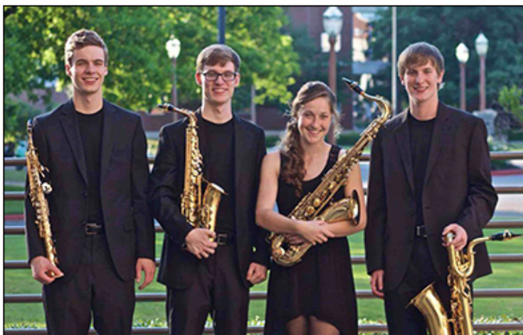
The Morpheme Saxophone Quartet