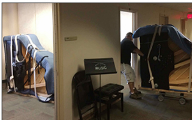
Summer 2016 Steinway grand piano delivery to McCrary

This summer, as part of an ongoing commitment by Central Administration at Baylor, the School of Music accepted delivery of three brand new Steinway grand pianos . These marvelous instruments were placed in three practice rooms in the Glennis McCrary Music Building and will be used exclusively by piano majors in the School of Music. We hope that this is the start of yearly deliveries that will upgrade our keyboard inventory throughout the School of Music.