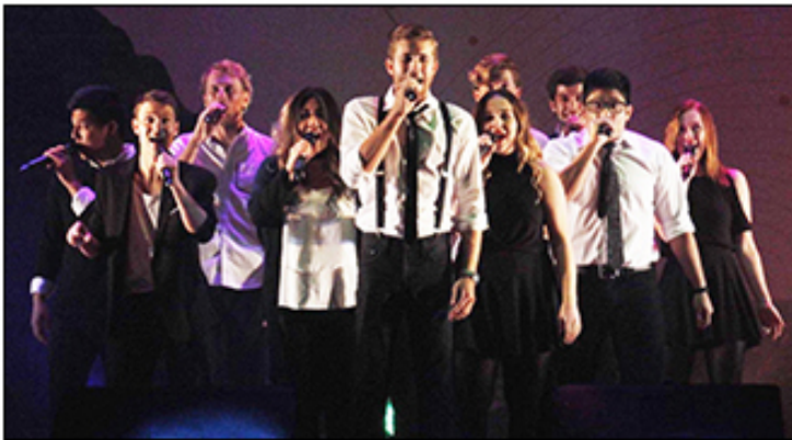
VirtuOSO performing in Taiwan