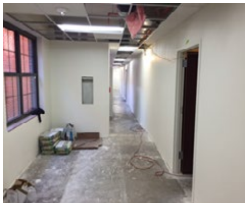
First floor faculty-staff apartment corridor