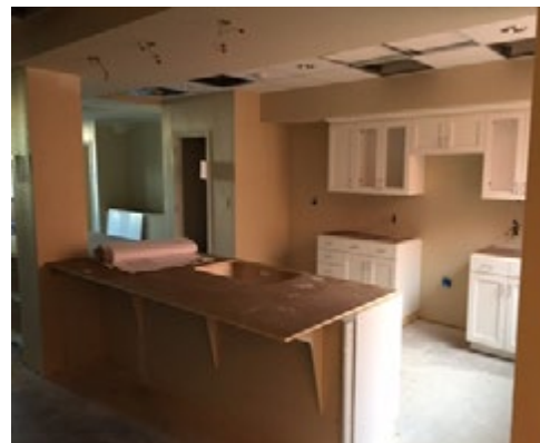
Faculty apartment kitchen millwork mostly installed