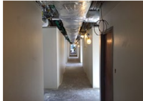
Residential corridor – old tiled walls covered with new sheetrock, HVAC ducting and overhead electrical in progress, new doors/frames going in for student rooms