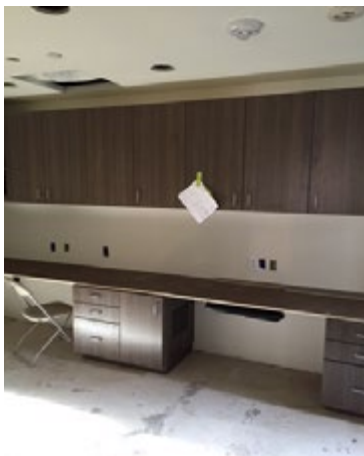
New CL&L office millwork going in