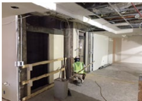
Old elevator demolition complete; new elevator installation begins mid-February