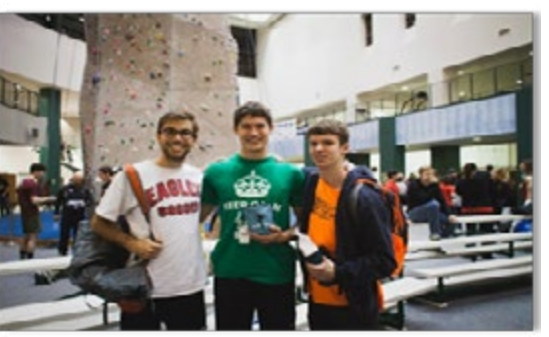
Winners of some of the generous donations from our sponsors

A University of Houston climber completing a bouldering problem Several area businesses donated snacks, water, clothing and prizes for BearClimb.