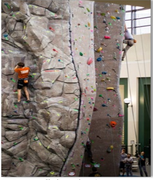
Climbing to the top!

Platinum level sponsors, The Bear Mountain, provided backpacks, hats, shirts, and more for winners within each division. Additional gear was donated by Gossamer Gear, Black Diamond, Lowes, Hole-in-the-Roof, Vitek's BBQ (Silver level), and ENO, Misty Mountain, Mountain Khaki, Alpine Mountain (Bronze level).