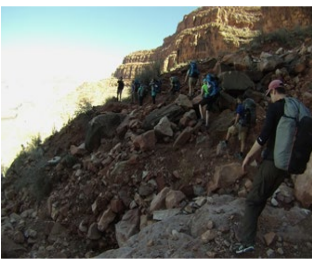
The Hermit Trail in Grand Canyon NP

students backpacking through Paria Canyon in northern Arizona.