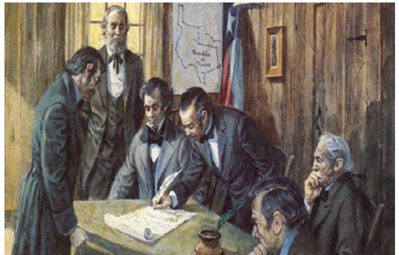
Founders Day, February 1, 2015. Celebrating 170 years of Baylor University.