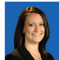
Libby Hackney Baptist Health System Birmingham, AL