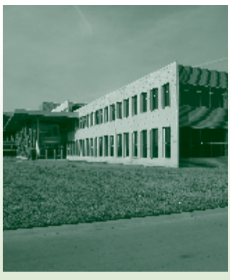
BRIC facility after Phase 1 Renovation, Dec. 5, 2012