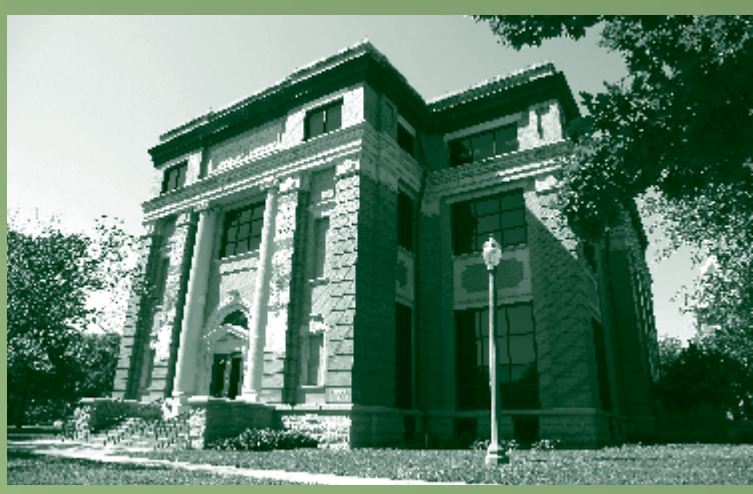
Search The Texas Collection at bearcat.baylor.edu.

Faculty and staff may easily access many items, including books, vertical files, and maps, via BearCat at bearcat.baylor.edu . Contact The Texas Collection for research assistance with collections or subjects that cannot be found via this system.