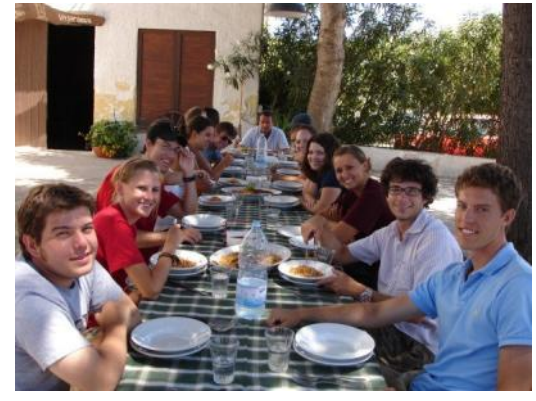
Si mangia bene!