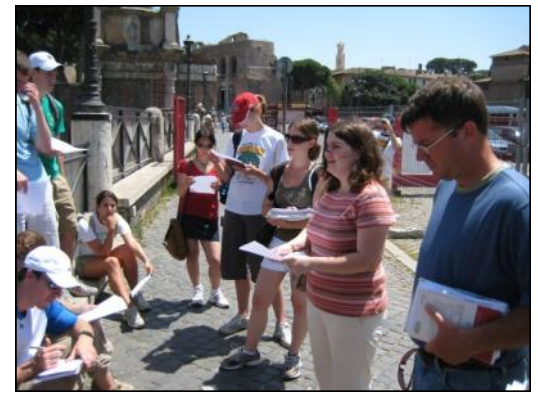
Reporting from Rome...