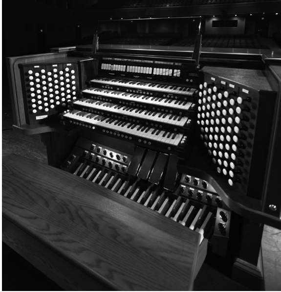
Shown above is the new 4-manual, 100-stop Walker organ in Waco Hall. The organ pictured on the cover is the 92-rank, 4-manual Petty-Madden in Jones Concert Hall, which will be used for recitals and lessons.

Please share this invitation with other interested students, and duplicate this brochure as necessary. The brochure also is available online at www.baylor.edu/busmc .