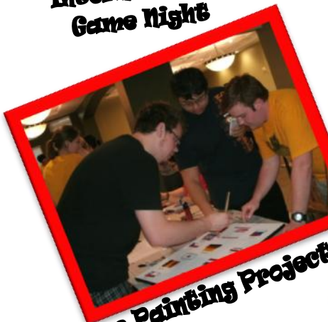
Class Painting Project