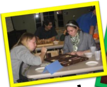
International Game Night