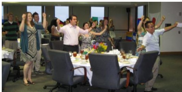
Students and Faculty dance to German song