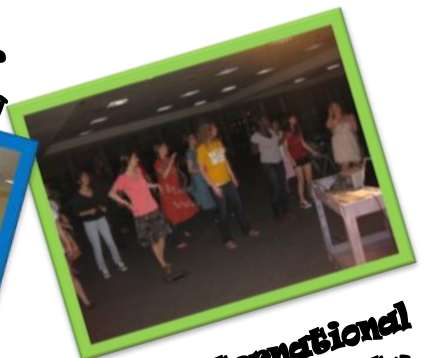
International Dance Party