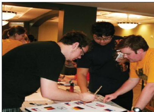
Three young men of GC-LLC show their artistic side

The groups worked diligently to create a masterpiece, some more artistic than others. Most importantly, all of the groups united to reflect on different cultures and how they can combine to make something beautiful.