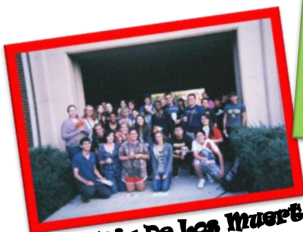
Día De los Muertos (Day of the Dead)