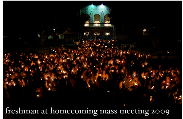
freshman at homecoming mass meeting 2009

As the days continued, they quickly turned into semesters, and now, here I am, a senior, completely done with all BIC courses. (Thankfully, I was much less nervous in subsequent classes.) And what a wild ride this has been! I had no idea that my dear friends whom I now hold closest to me were sitting in that same auditorium when the beach ball was thrown. I had no idea that I would become comfortable with public speaking, and would actually come to enjoy it. I had no idea that late night paper writing sessions would also be late night deep conversation starters, and that my life