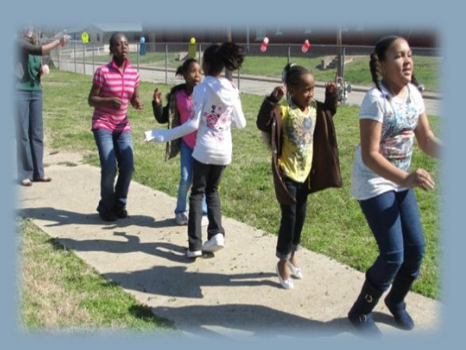
JH Hines students and friends enjoy activities during last year's Parent Involvement Day Block Party.

The Academy for Leader Development and Civic Engagement, in conjunction with Waco ISD, is continuing a partnership with seven elementary schools to work with our servant leadership courses that began in 2009. Each year we continue to strengthen this relationship by supporting early childhood development and public education while providing a forum for college students to engage in meaningful