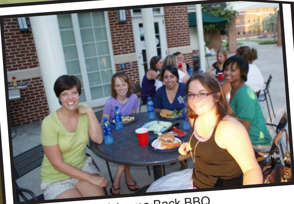
Welcome Back BBQ