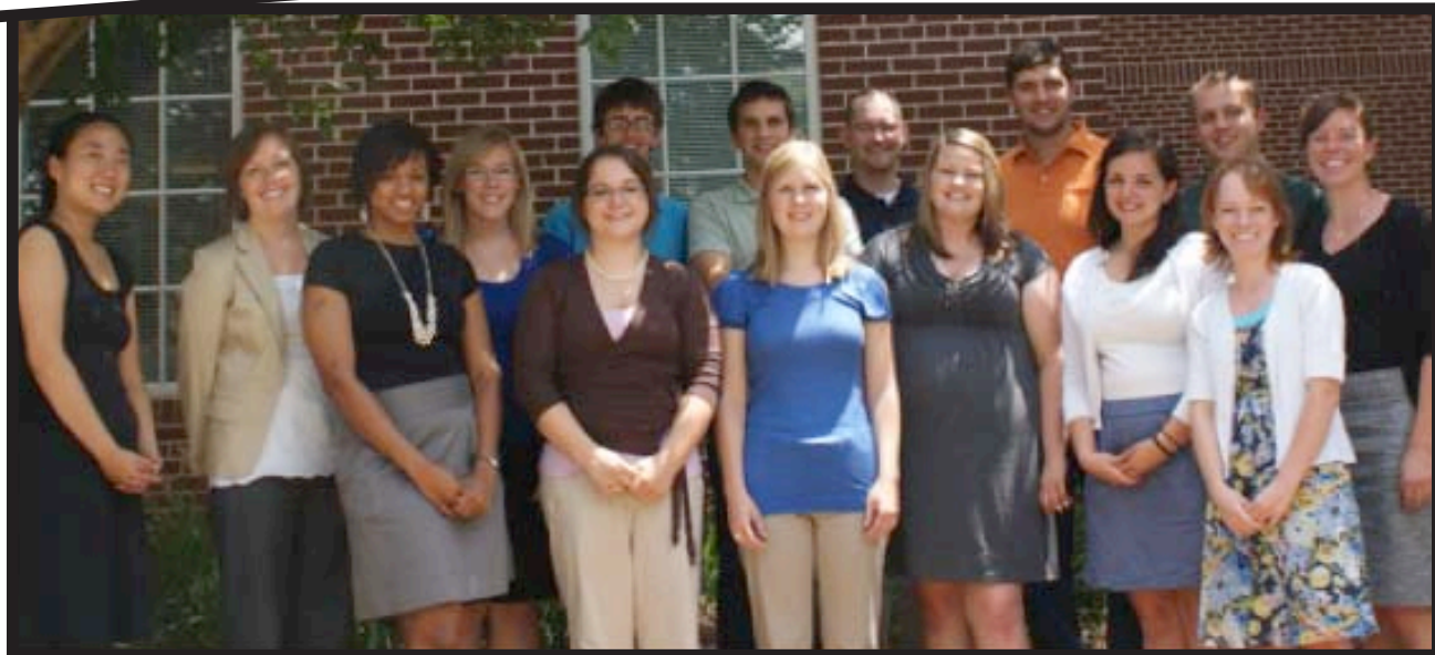
The newest cohort at HESA Orientation