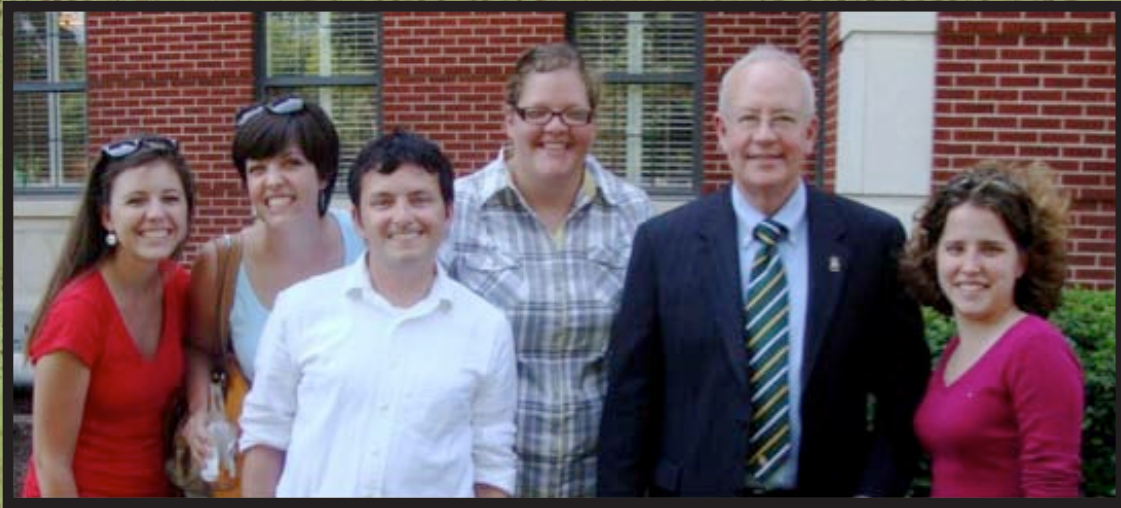
President Starr with some members of the 2009 Cohort