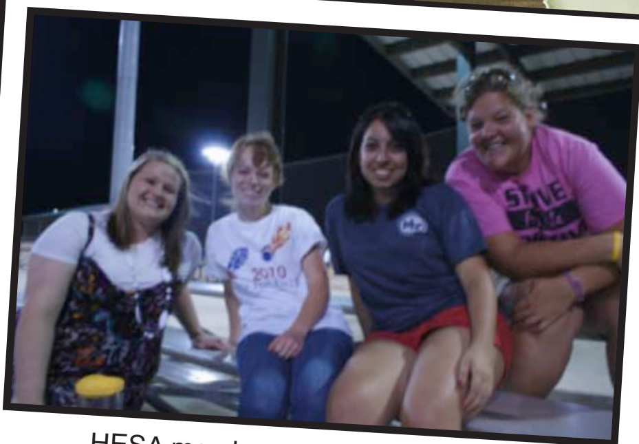
HESA members at a softball game