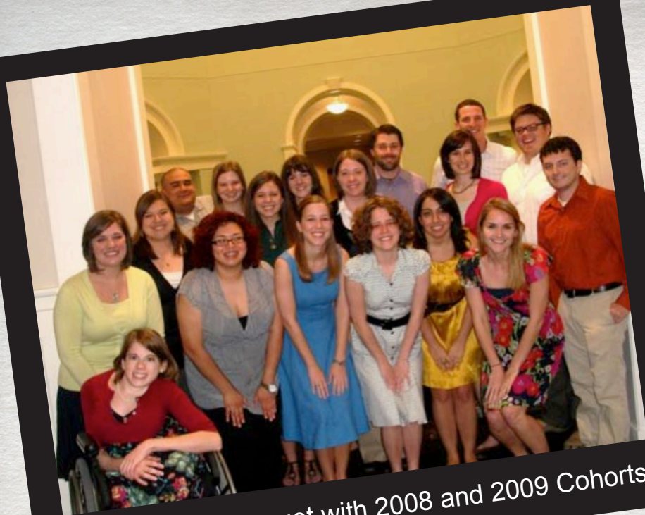
End-of-Year Banquet with 2008 and 2009 Cohorts