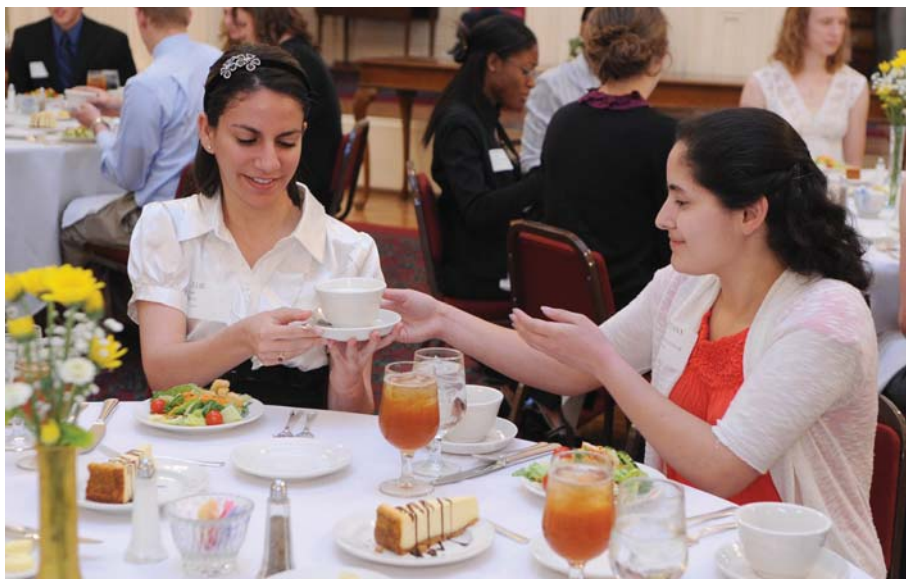
PASSING FANCY: Baylor students practice table etiquette at a university-sponsored course.

Baylor students get a crash course in table and business etiquette