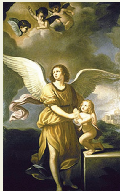
L'Angelo Custode by Guercino (Giovanni Francesco Barbieri), 1640 Civic Museum, Fano, Italy